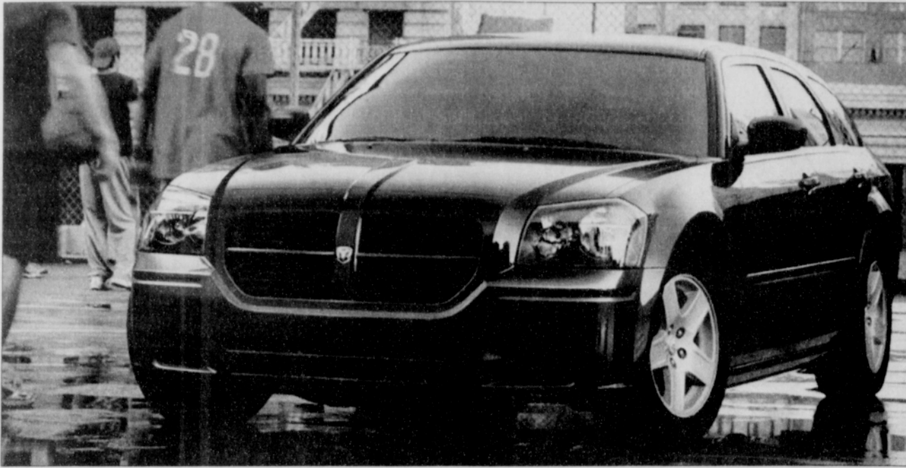
Tested Vehicle Information: Price $27,435; Engine: 3.5L High-Output 24-valve V6; Transmission: Four-Speed Automatic.

The Dodge Magnum is one of those. Even though there is plenty of power the acceleration it is smooth, allowing your neck not to snap back when stomping on the accelerator. The Magnum excels with its smooth and solid ride, tight handling and quiet cabin.