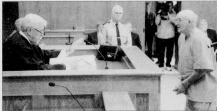
Edgar Ray Killen faces a judge during his arraignment Friday on murder charges in the deaths of three civil rights workers, 40 years after their deaths.

In 1967, the Justice Department tried Killen and 18 other men - many of them also Klan members - on federal civil rights violations. Seven