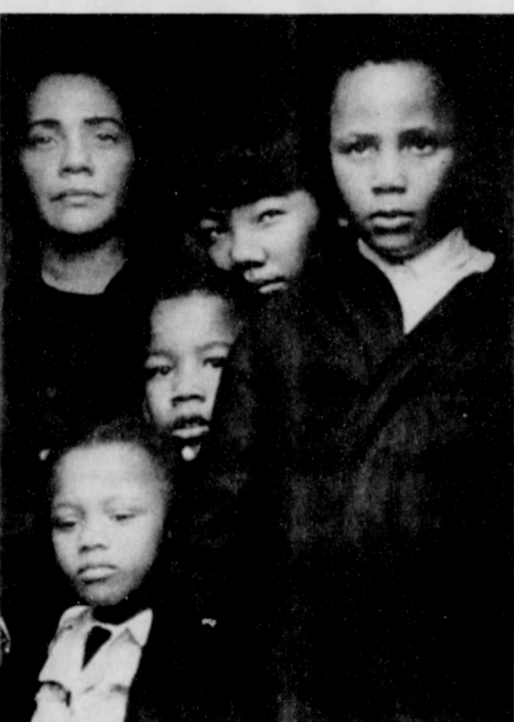
A portrait of Martin Luther King Jr.'s widow Coretta Scott King (top left), and their children.

• Dec. 1, 1955 Mrs. Rosa Parks refuses to give up her bus seat to a white man in Montgomery, Ala. She is arrested. When Mrs. Parks was brought to trial she was found guilty of violating a Montgomery city ordinance and ordered to pay a fine.