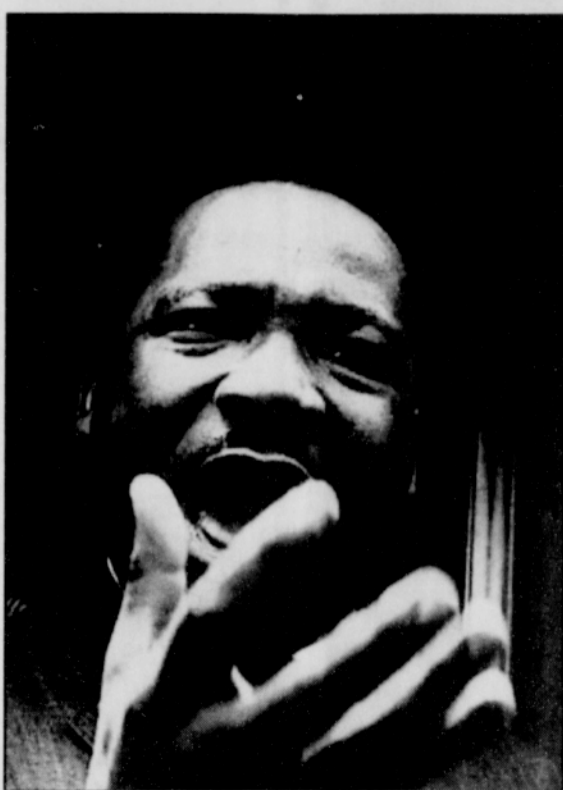
Martin Luther King, Jr. displayed a natural charisma at an early age derived from his confidence, intelligence and passion for equality.

• Nov. 17, 1955 Yolanda Denise King, the Kings' first child is born.