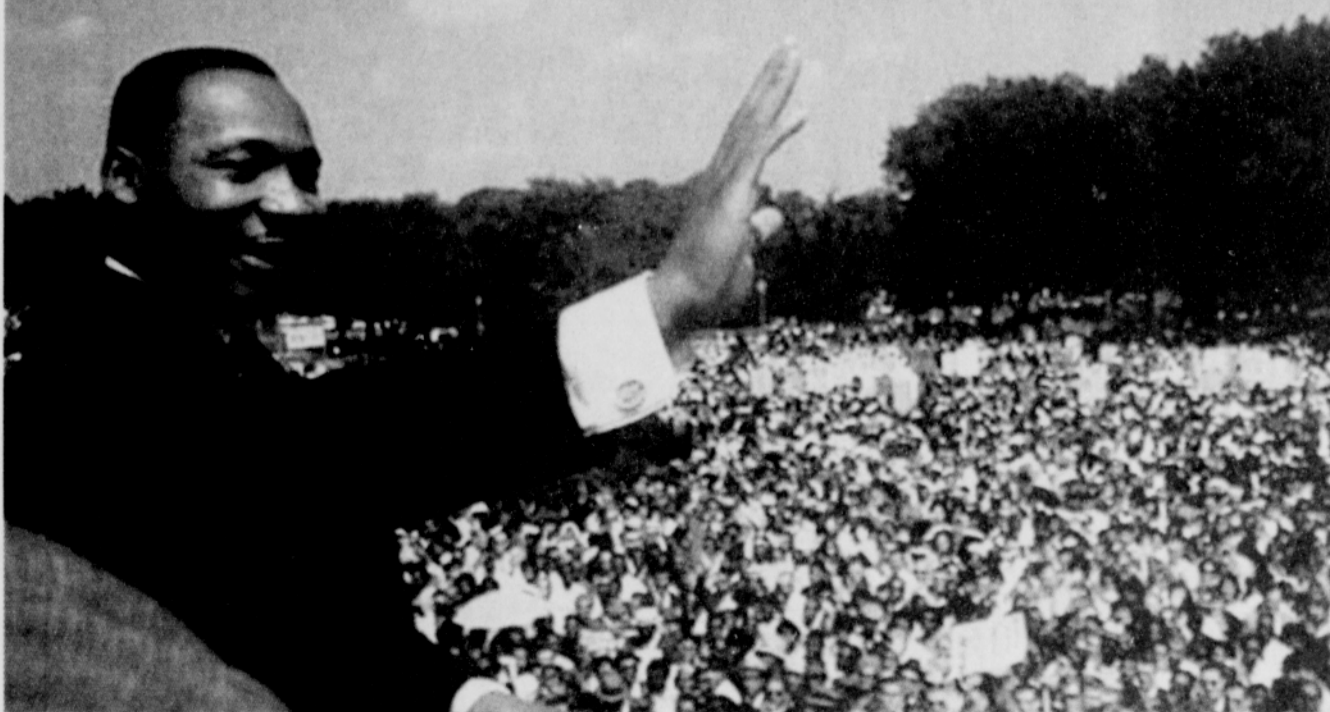
Rev. Martin Luther King Jr. was a champion for peaceful solutions at home and abroad.