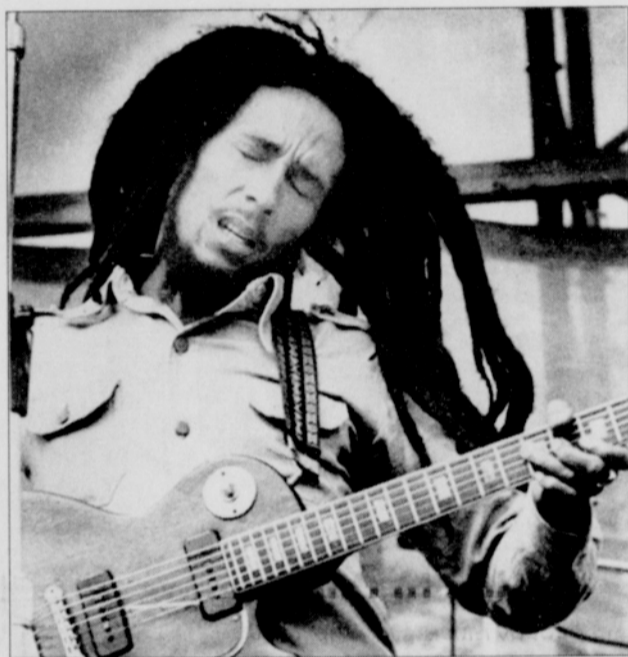
Jamaican reggae singer Bob Marley in 1979.