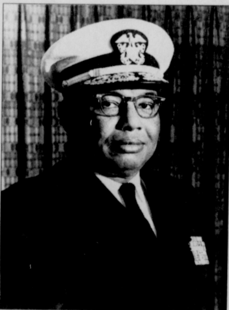
Samuel L. Gravely Jr. - The Navy's first black admiral and the first African American to serve as a fleet commander; died Oct. 22