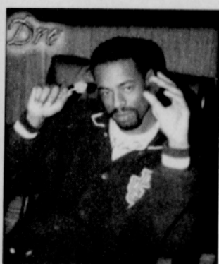
Mac Dre - West coast rapper who made his rap debut in 1989 with the Young Black Brotha EP; died Nov. 1.