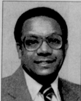
Elvin Ray Jones - Renowned jazz drummer; in John Coltrane's quartet; died May 18.