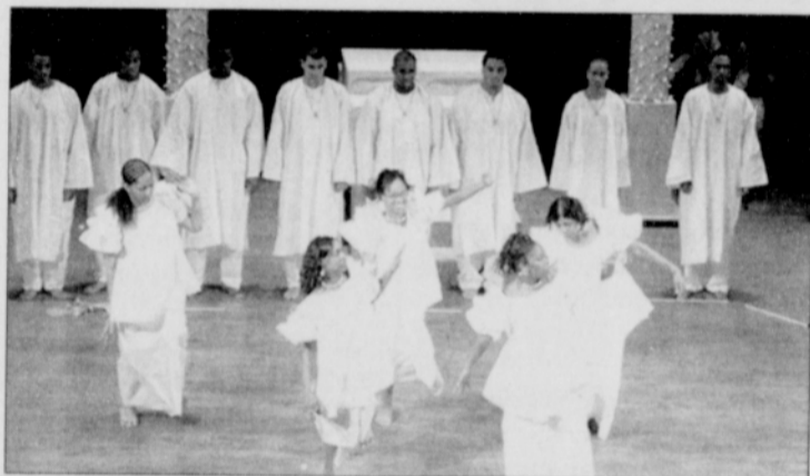
Young men and women perform during the Rites of Passage ceremony in last year's annual Bridge Builders gala.

play oldies, rhythm and blues, jazz, Hip Hop and rap until 2:30 a.m. This post celebration will include a buffet