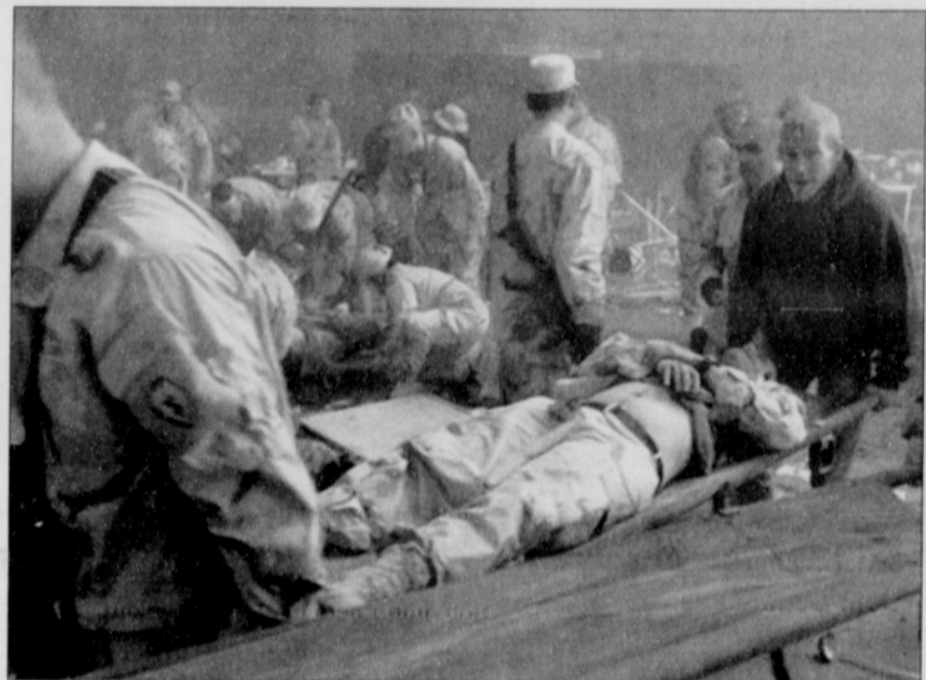
Workers and U.S. soldiers tend to the wounded after a mortar attack on a U.S. military dining facility.

Amid the screaming and thick smoke in the tent, soldiers turned