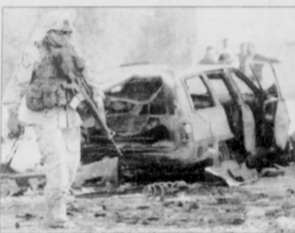
A US soldier inspects the site where a suicide car bomber killed seven people Tuesday at a Green Zone checkpoint in Baghdad's district that houses Iraq's interim government and foreign embassies.

No U.S. troops were killed in either blast, but the American military said two Marines from the 1st Marine Expeditionary Force based in western Iraq died in combat Monday, bringing the number of Marines killed to 10 in three days.