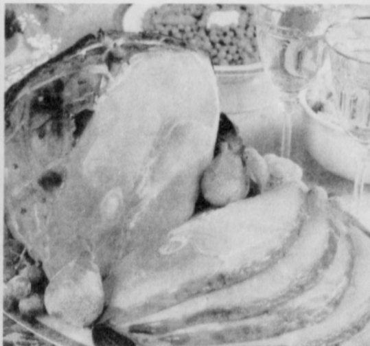
Unlike Smoked Portion Hams, our Butcher's Cut Smoked Hams are Full Half Hams with No Center Slices Removed, giving you a better value.