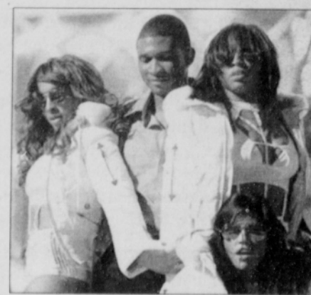
Usher dominates the 2004 Billboard Music Awards in Las Vegas.

The 26-year-old singer opened the show with a blast, dropping in on a cord to perform "Bad Girl" while a bevy of beautiful women clad in white parkas, briefs and snow boots gyrated around him.