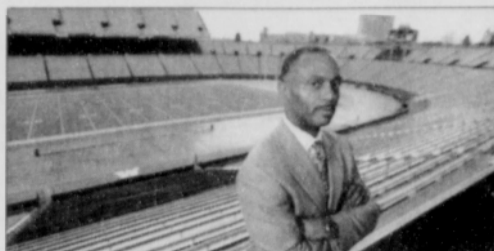
University of Washington's new head football coach, Tyrone Willingham, pauses for a portrait at Husky Stadium in Seattle.