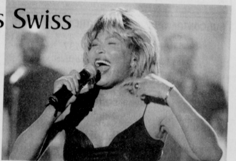
Tina Turner performs a song during the German television show "Wetten Dass...?" ("Bet It...?") in Leipzig, Germany, on Nov. 13. Turner, who just celebrated her 65th birthday, is enjoying her quiet life in Switzerland, but reportedly has no plans to retire from performing.

Turner will star as the Indian goddess Shakti in Ismail Merchant's new film, "The Goddess," and she recently released a new CD. Her screen credits also include 1985's "Mad Max Beyond Thunderdome" with Mel Gibson. "Switzerland is wonderful,"