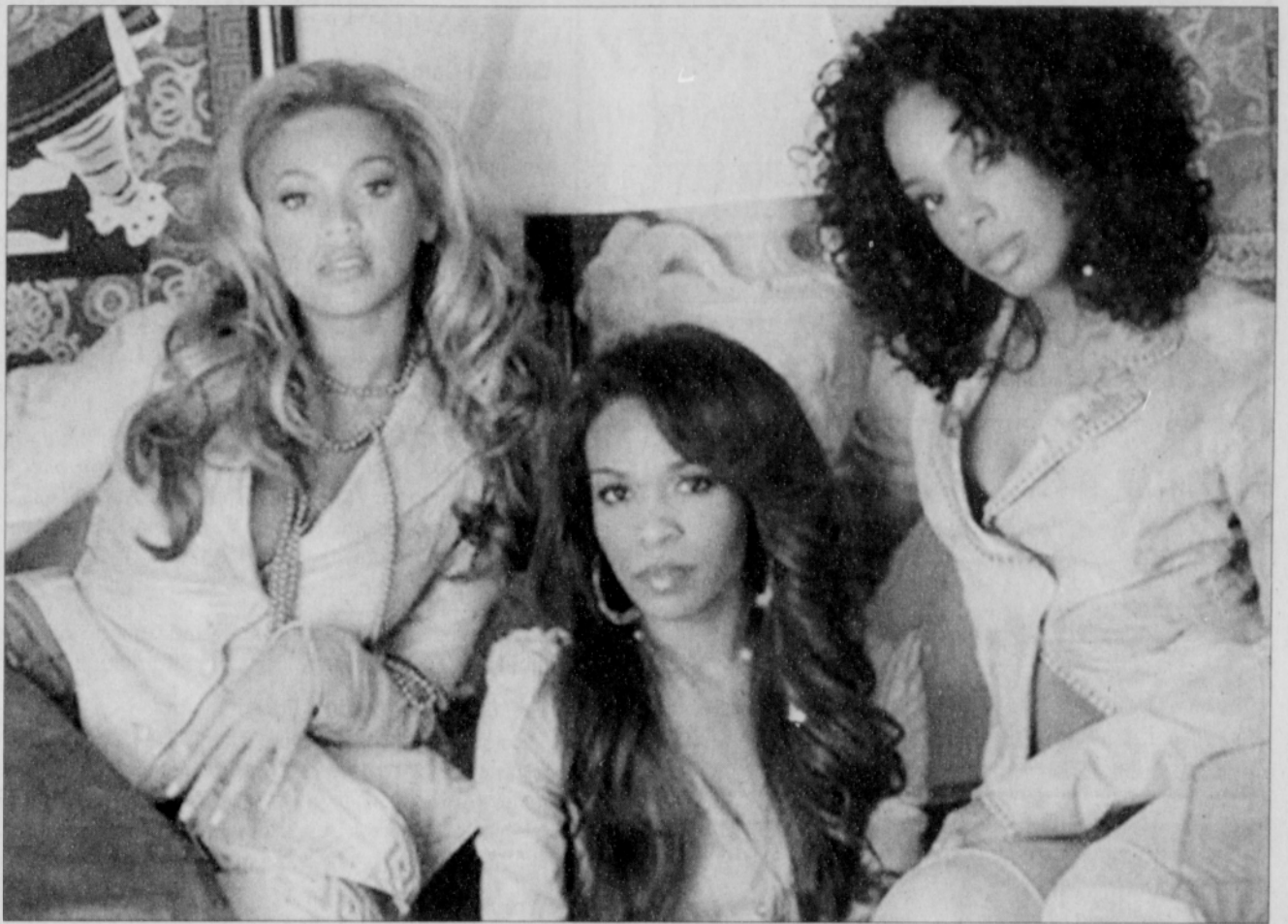
Beyonce Knowles (from left) Michelle Williams and Kelly Rowland reunite as Destiny's Child.

"It's kind of frustrating because we always sang lead on every song since