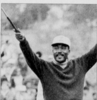
Charlie Sifford scores a major win in this 1969 photo. Monday he became the first black member inducted into the World Golf Hall of Fame.

"Charlie won tournaments, but more important, he broke a barrier," golfing great Jack Nicklaus said. "I think what Charlie Sifford has brought to this game has been