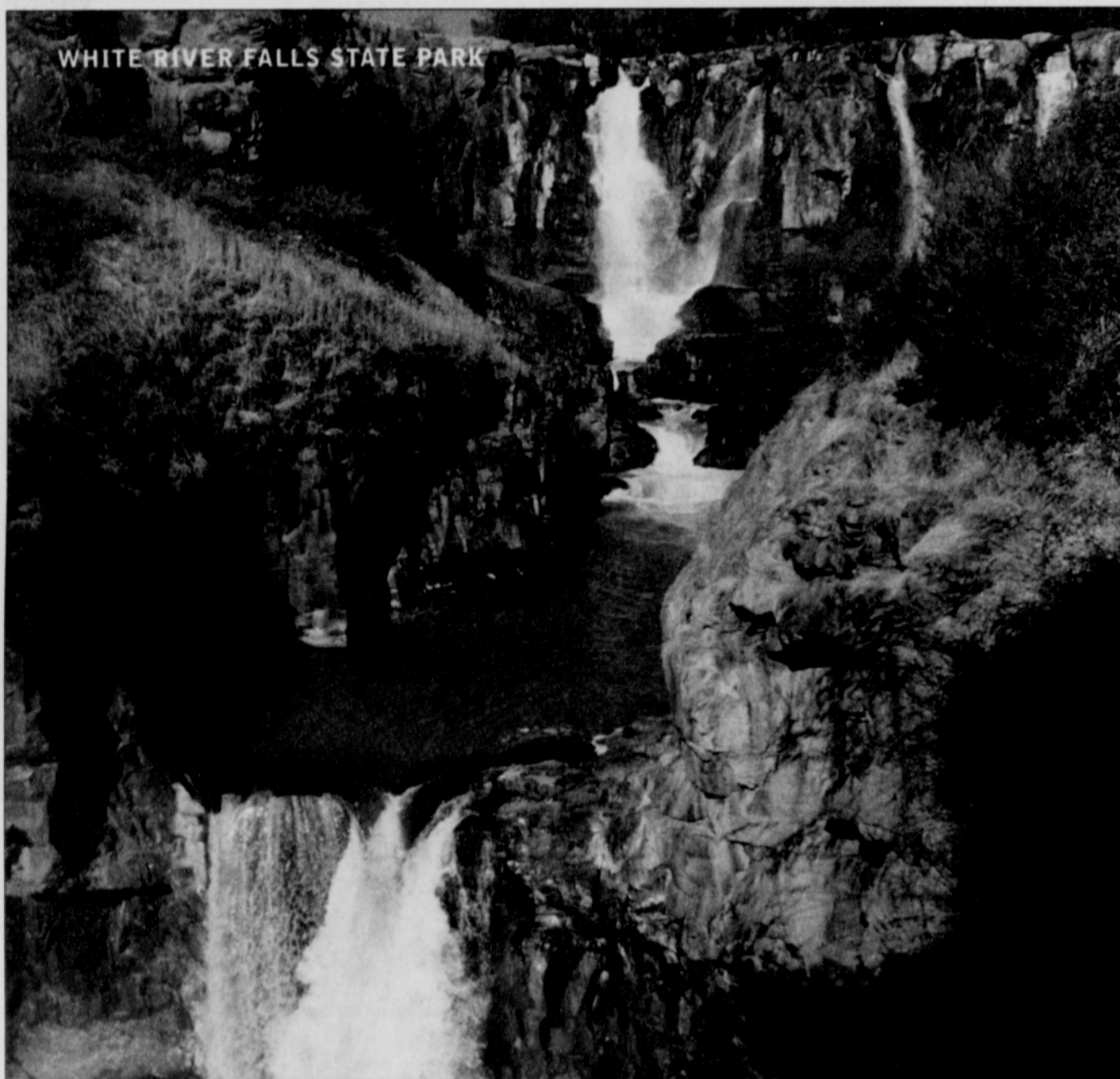
WHITE RIVER FALLS STATE PARK

Out in the dry wheat lands of Oregon's high desert, there is an oasis. And hidden in that quiet, green place, there is a frothing, churning, thundering 150-foot waterfall. Some have compared it to Niagara. Others are reminded of Yosemite. But when you're there, White River Falls State Park is truly an Oregon kind of place.