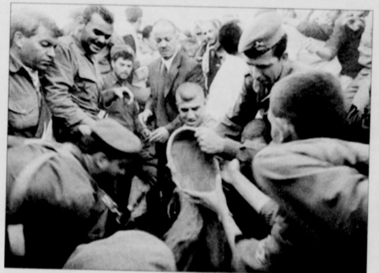
Mourners pour sand from Jerusalem's al-Aqsa mosque into the underground burial tomb where Yasser Arafat's casket was placed Friday.

The frenzied burial took place at Arafat's headquarters in the West Bank city of Ramallah, where Israel had kept him under siege for nearly three years. It came just hours after an orderly funeral ceremony in Cairo, where the only outburst of emotion