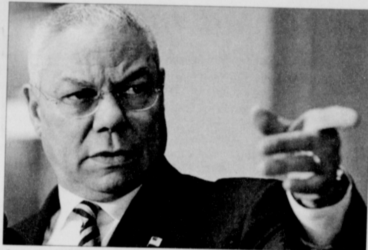
Colin Powell gestures during a speech Monday.

tier shake-up that has presented several agency heads with the clear impression that their services were no longer needed. White House counsel Alberto Gonzales is Bush's nominee to replace Attorney General John Ashcroft.