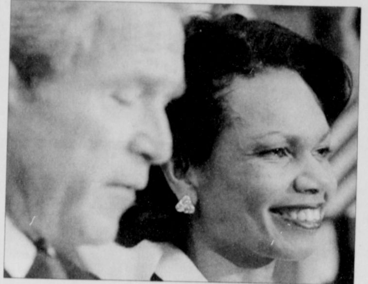
National Security Advisor Condoleezza Rice smiles as President Bush Tuesday announces that she is his nominee for Secretary of State to replace Colin Powell.

Rice is the second White House loyalist to land a Cabinet post since Bush's re-election triggered a top-