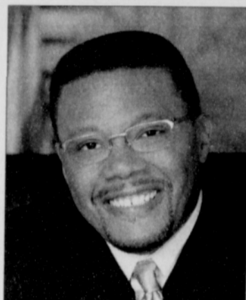
Judge Greg Mathis

Why can't we criticize policies that hurt African-American people? That is what the NAACP is for.