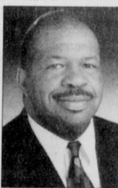
BY U.S. REP. ELIJAH E. CUMMINGS

While I am encouraged by the news that the nation's payrolls made moderate strides during the month of October and new jobs were created, the nation's unemployment rate increased to 5.5 percent. In addition, the unemployment pic-