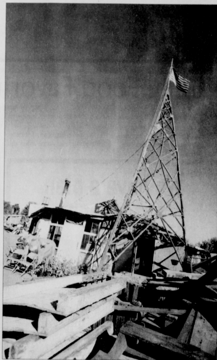
The American flag flies high over Dignity Village.

continued ▲ from Front "I was computer illiterate until I became homeless," muses McCarthy.