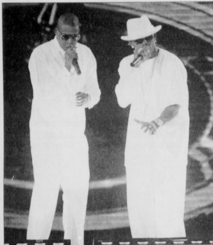
Jay-Z (left) and R. Kelly perform Thursday during a concert at Nassau Coliseum in Uniondale, N.Y.