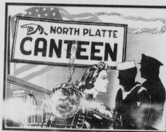
The North Platte Canteen is a story of spirit and generosity during World War II.