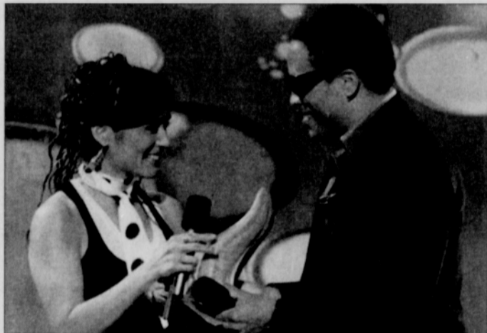
Recording artist Julieta Venegas receives the Artist of the Year Award from Lenny Kravitz at the 2004 MTV Latin Video Music Awards in Miami Beach.

The award show will air on MTV on Saturday, Oct. 30.