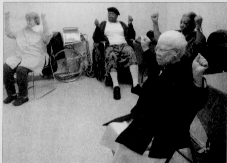
An exercise class that helps people keep their mobility is an example of services at the Multicultural Senior Center that could lose funding because of Ballot Measure 26-64.