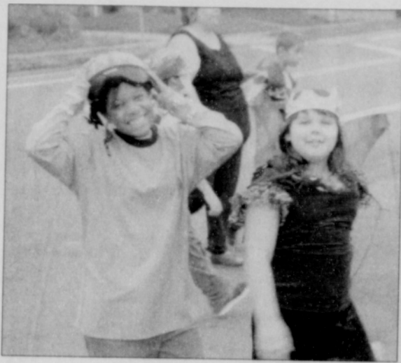
Students from Applegate School in north Portland dressed up as characters from their favorite books last weekend at the annual Story Book Parade.