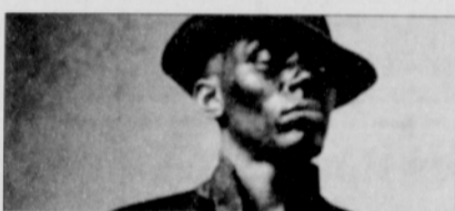
Mos Def releases 'The New Danger.' Fusion Album Out

The Martha Graham Dance Company, presented by White Bird, performs at the Arlene Schnitzer Concert Hall on Wednesday, Oct. 27. Tickets range from $23 to $57. Call Ticketmaster or the PCPA box office for tickets.