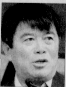
U.S. Rep. David Wu, D-Ore.

(AP) — U.S. Rep. David Wu, who represents Oregon west of the Willamette River to the Oregon Coast in Congress, and who is in a tight re-election race admitted Tuesday that while he was a college student 28 years ago, he was disciplined by school officials for "inexcusable behavior" toward an ex-girlfriend.