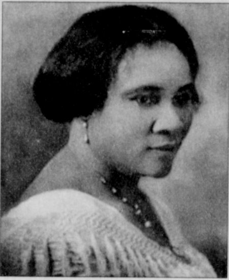
Madam C.J. Walker