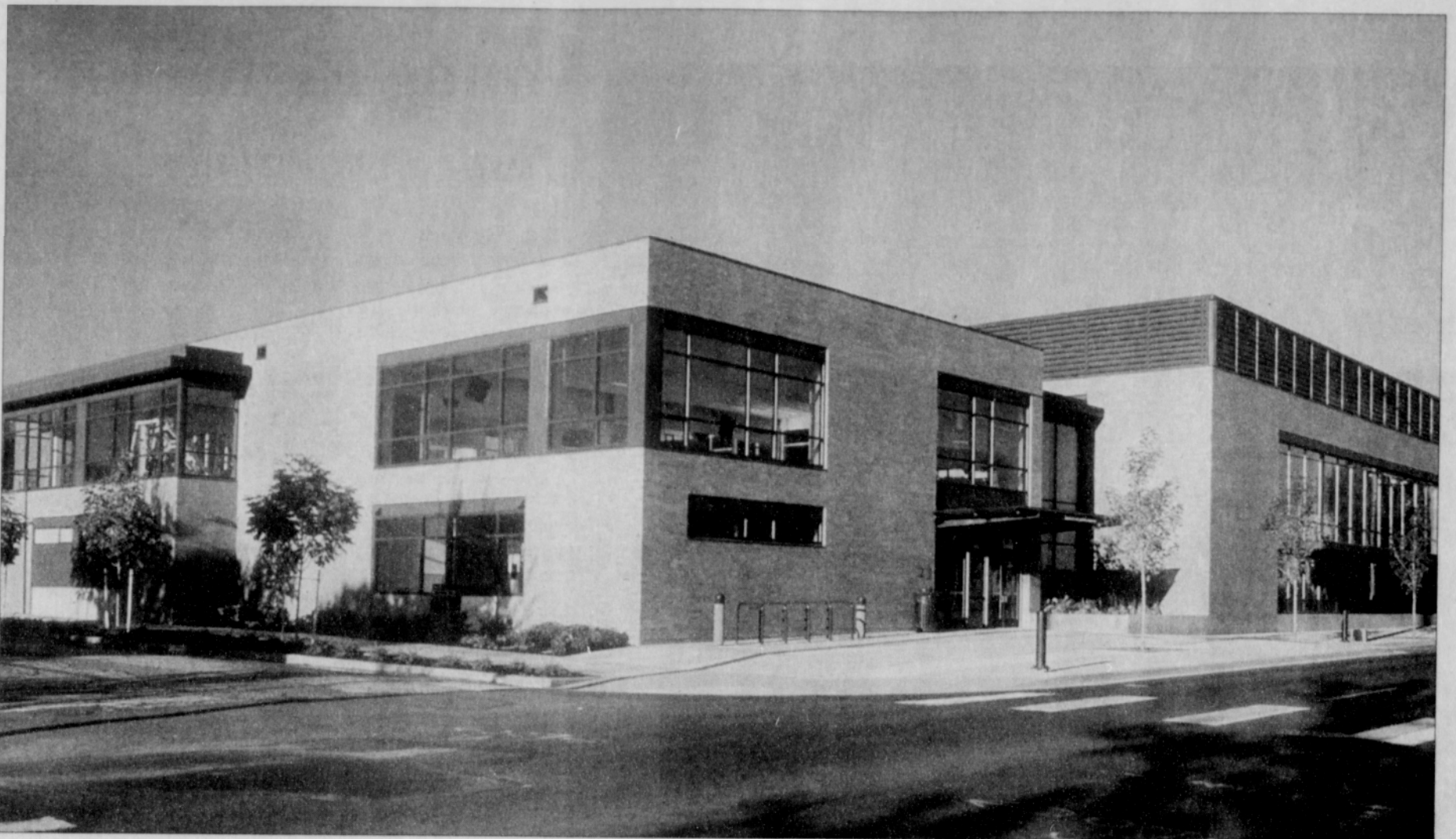
The new physical education building and gym on north Killingsworth is one of six new or remodeled buildings that will transform the Cascade Campus of Portland Community College into center of higher education.

November 2000 voter-approved $144 million bond measure. The new facilities at the Cascade Campus will create more class space, unite similar programs under one roof and expand services for students. The campus eventually will have gained four new buildings and a new science building wing (completed in September 2003) and will be more than one-third larger than its current size, adding 3.57 acres of land and 120,000 square feet of state-of-the-art classrooms, labs and support space.