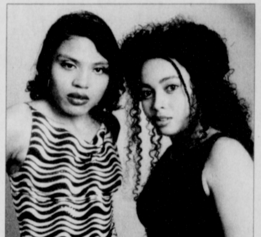
Siren's Echo will perform Oct. 23 at Berbat's Pan as part of the POH-Hop, Portland's 9th annual hip-hop festival.