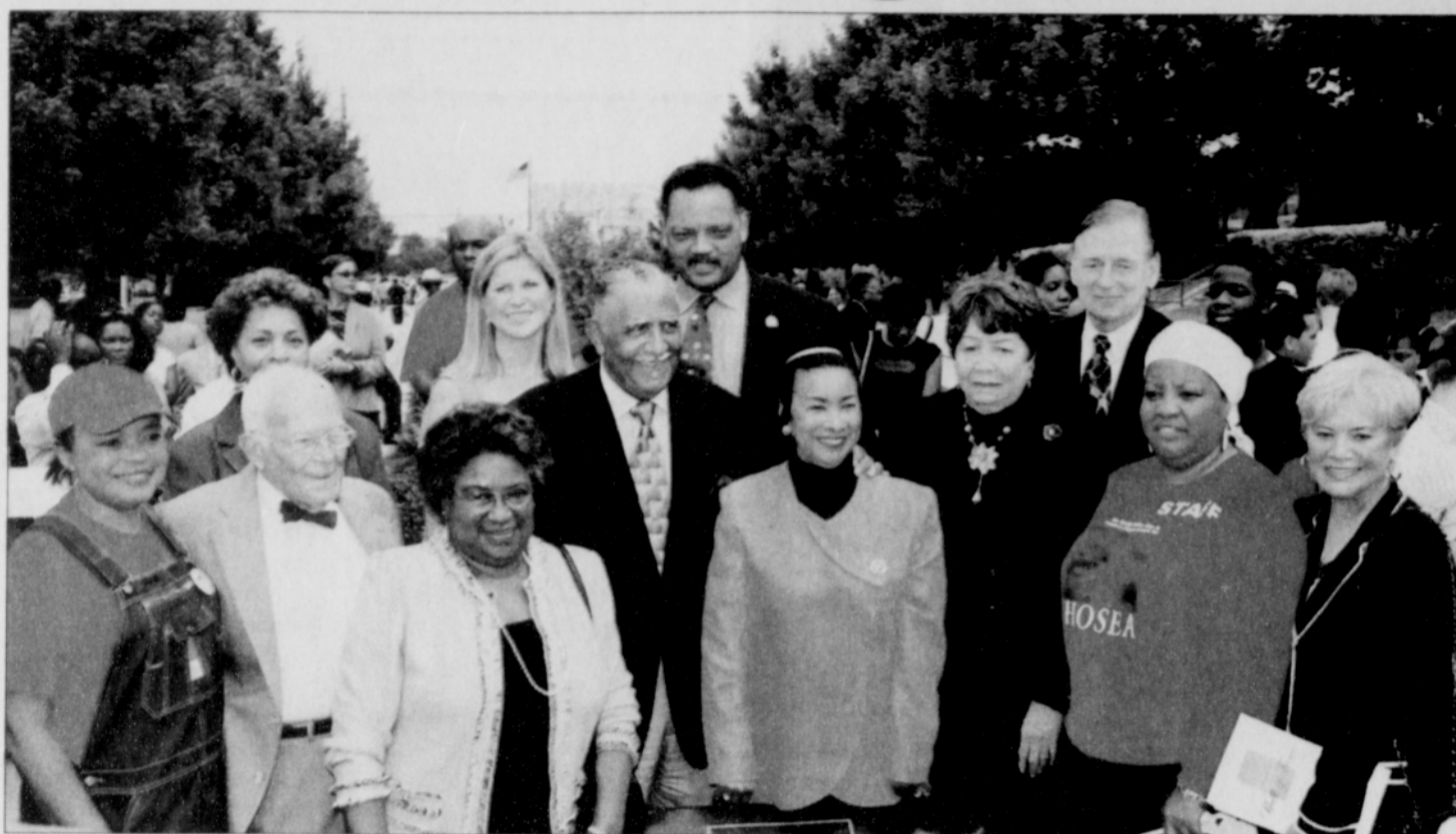
Members of communities of all colors, along with Jesse Jackson (center), stand united for civil rights at the new International Civil Rights Walk of Fame on the grounds of the Martin Luther King Jr. National Historic site in Atlanta, Ga.

to capture the spirit of the moment by standing in the footprints of the honorees.