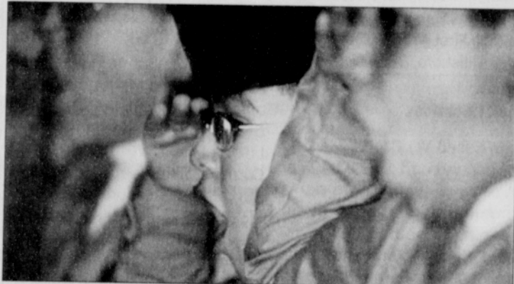
Children sing Mexico's national anthem before starting class in Mexico City.