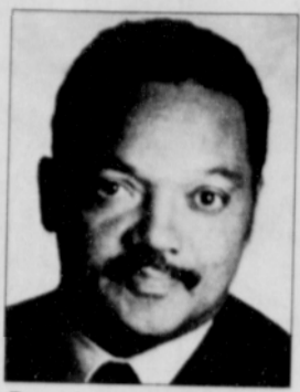
Rev. Jesse Jackson Sr.

Civil rights leader Rev. Jesse Jackson Sr. and his Rainbow/Push Coalition have called for abolishing the Electoral College and placing the right to vote under federal protection to ensure democracy in the United States. Jackson said the entire election of 2004 is under a cloud because of the lack of voter protection. "The crisis has deepened since