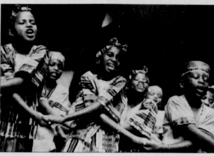
The African Children's Choir has inspired audiences around the world.

The Grammy-nominated African Children's Choir will put on a free concert, Sunday, Oct. 3 at the Portland First Church of the Nazarene, 6100 S.W. Raab Rd.