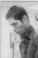
Man seen in surveillance video is wanted for a bank robbery on Hayden Island.

The man is described as a white or Hispanic male in his mid to late 20s with a thin build, between 5 feet 8 and 5 feet 10 inches tall, with