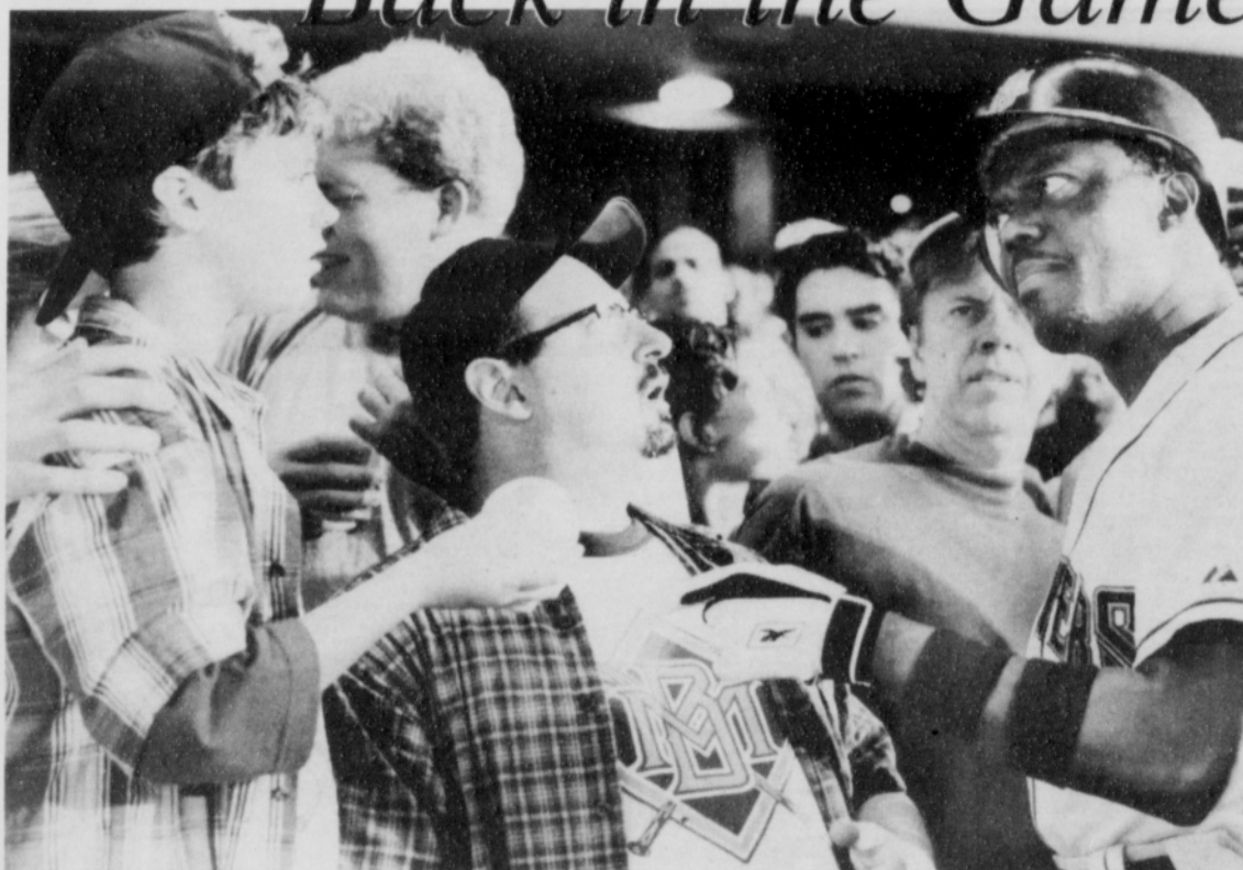
Milwaukee Brewers superstar Stan Ross (Bernie Mac) confronts fans who just caught his 3,000 th hit and ticket into the Baseball Hall of Fame.