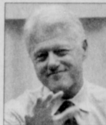
Former President Bill Clinton

quadruple bypass operation Monday at New York Presbyterian Hospital/Columbia. His heart disease was extensive, with blockages in some arteries well over 90 percent, doctors said.