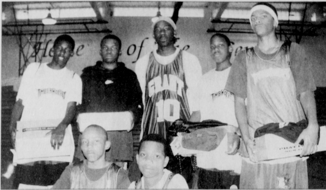
NBA star and Portland native Terrell Brandon is surrounded by kids from his basketball clinic at the Matt Dishman Community Center in northeast Portland. Brandon generously handed out free clothes, shoes and school supplies on Saturday to the participants of the two-day program.

We are an Equal Opportunity Employer and encourage bids from minority, women and emerging small business subcontractors