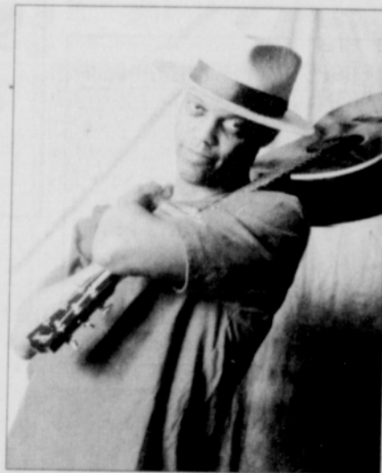
Blues and folk singer Eric Bibb will perform this month at Mississippi Studios in north Portland.

Bibb has toured throughout the world, enjoying success in the United States, Canada, England, France, Germany, Sweden, Japan and Australia. He and his band have played at many major festivals worldwide. His talent for both performing and songwriting has been recognized with a Grammy nomination and most recently for the 2003 W.C. Handy nominations for artist of the year, acoustic blues and acoustic blues album of the year.