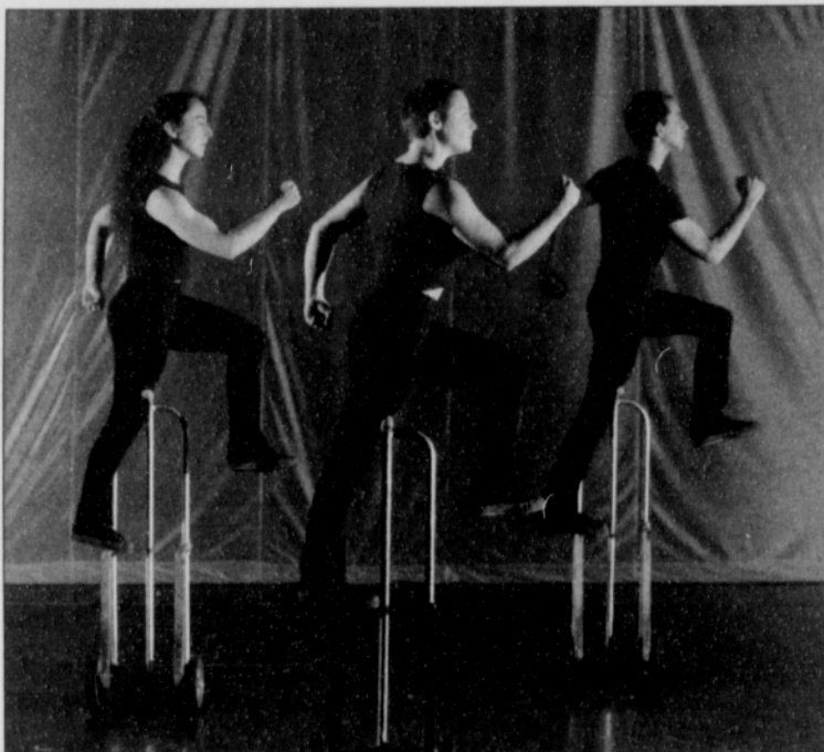
The Hand Truck Trio is one of the amazing vignettes adding energy to the dance performance Do Jump! at the Oregon Zoo.

On Wednesday, Aug. 25, Do Jump! will bring their fusion of live music, acrobatics, aerial dance, comedy, theatre and contemporary movement using everyday objects as props, such as ropes, ladders and pieces of furniture. Tickets for this performance are $9 and are available at 4 p.m. on the day of the show.