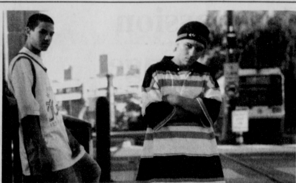
Portland rap duo Dynamix to perform their new song “Chillaxin’ on the MAX” before the game.

Kerry also pledged to “open the doors of the White House to Native Americans.” And in an unusual pledge, he said he would prod the nation’s news executives to increase the number of jobs for Native Americans in the media.