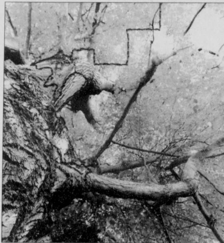
Meg Rowe's "The Shape of Green" series is inspired by nature walks through northeast Portland neighborhoods.

Her walks ramble and weave through parks and green spaces, linking each park to its neighborhood, and connecting diverse communities from Kenton Park in north Portland to Dawson Park in the heart of the Eliot neighborhood. The paths are reflected in the stitched maps, composed of fabric, thread and digital imagery mounted