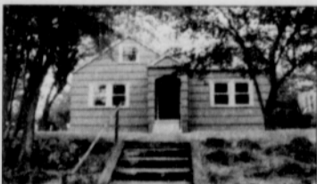
5732 NE 11 th $750