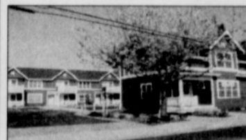
41 NE 127 th $675