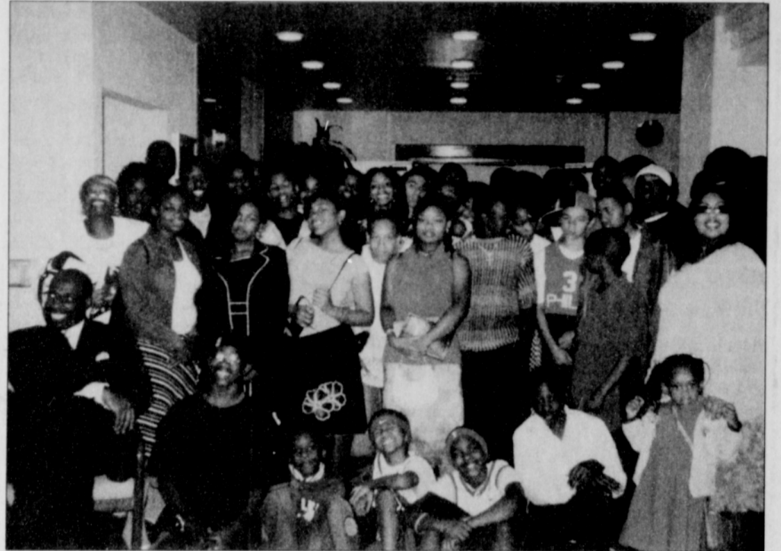
Fifty-six area residents gather for a group picture on their trip to southern California to attend a religious conference.

Business and organization sponsors included Portland Bottling, House of Umoja, New Hope Community Church, New Life Church of God in Christ, Boy Scouts of America, Albina Fuel, Killingsworth Little Chapel of the