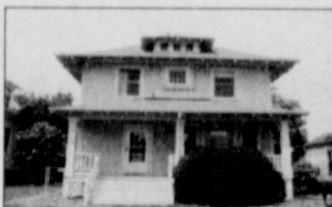
525 NE Jessup $950