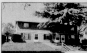
5121 & 5125 NE 28 th $675