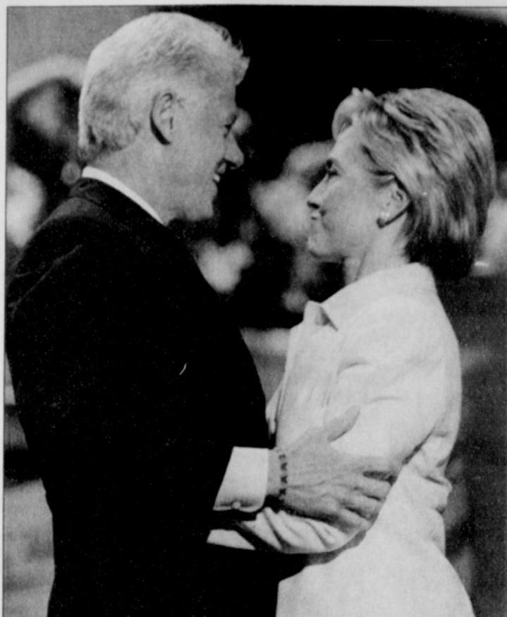
Sen. Hillary Rodham Clinton, D-N.Y., greets her husband, former President Bill Clinton after introducing him to delegates at the Democratic National Convention, Monday, July 26, in Boston.

Kerry is not a dynamic speaker like the Clintons and he lacks their