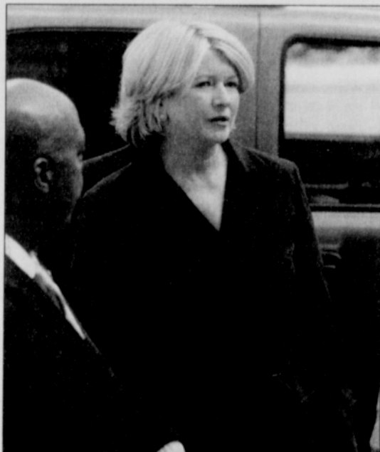
Martha Stewart arrives for sentencing at Manhattan Federal Court in New York.

Stewart, who was also ordered to serve five months of home confinement and fined $30,000, did win