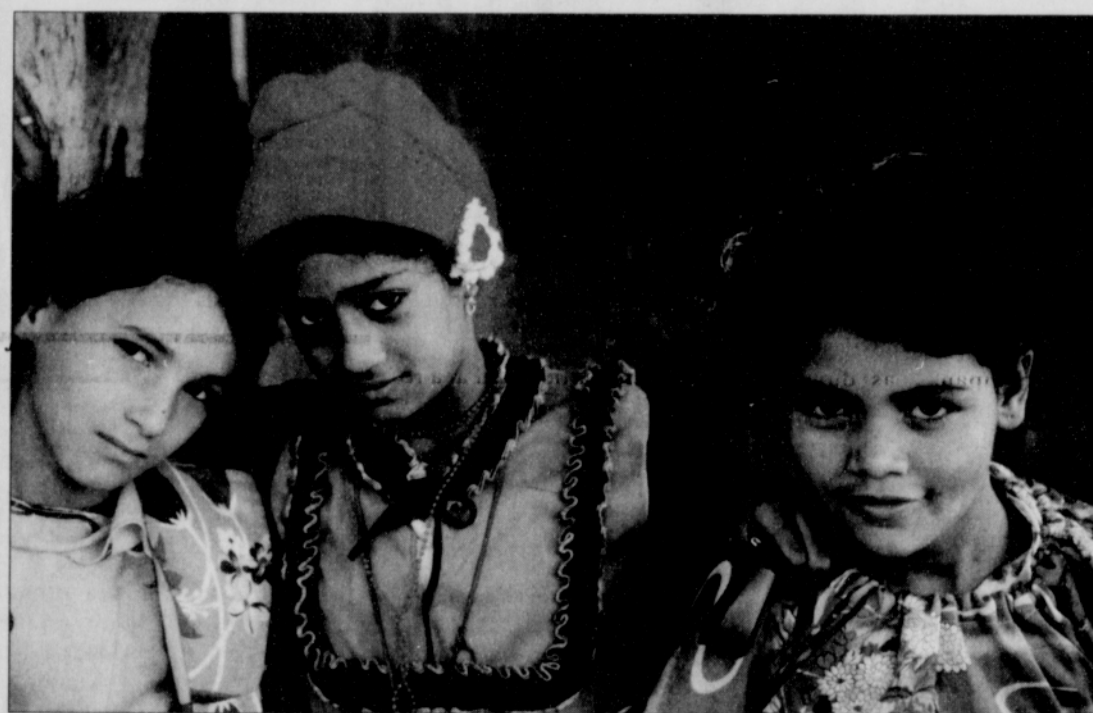
An exhibit of artwork by local artists will benefit children of war in Afghanistan.