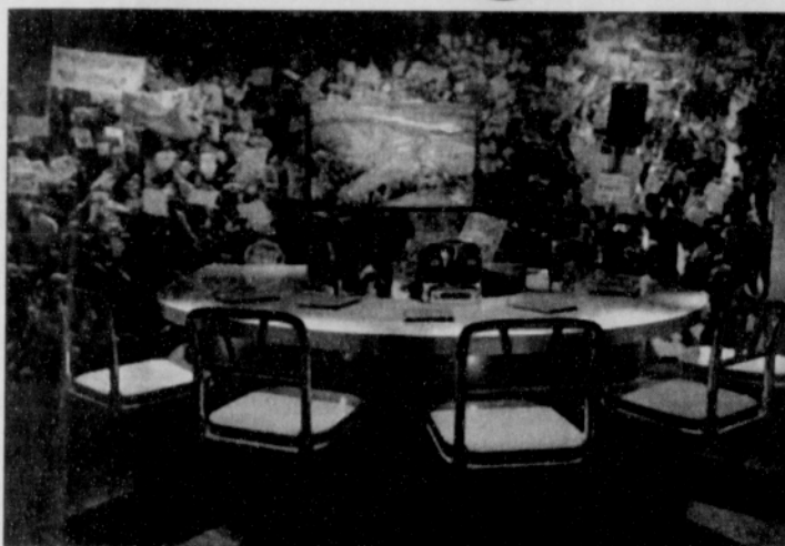
A historic photo shows the Newberry's lunch counter in downtown Portland.

The exceptional exhibit is inclusive of every major group of people that have history in the state, including African Americans and Japa-