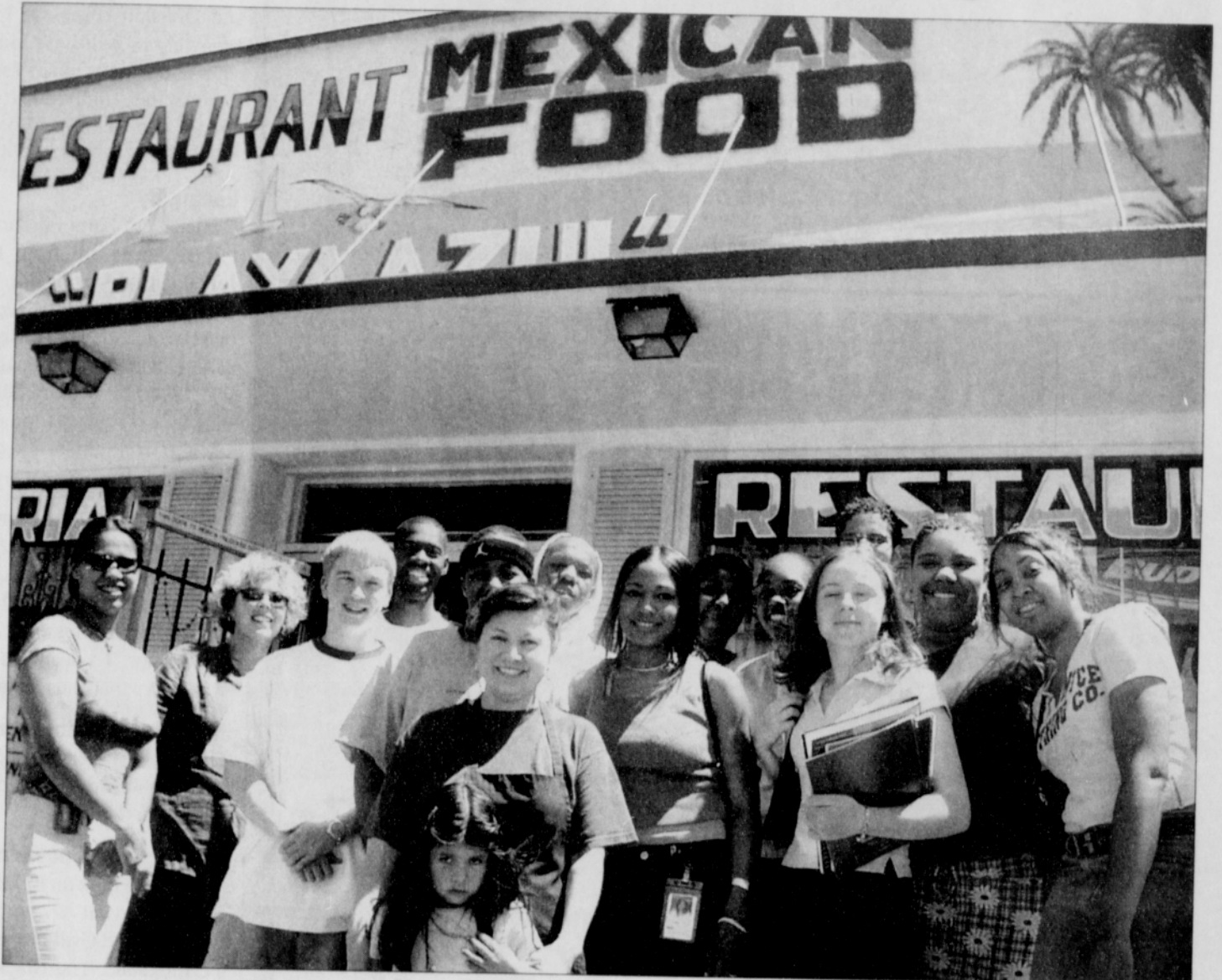
Young experts in business are developing marketing plans for local stores and restaurants along the new Interstate Max Yellow Line to help them profit from new foot traffic.