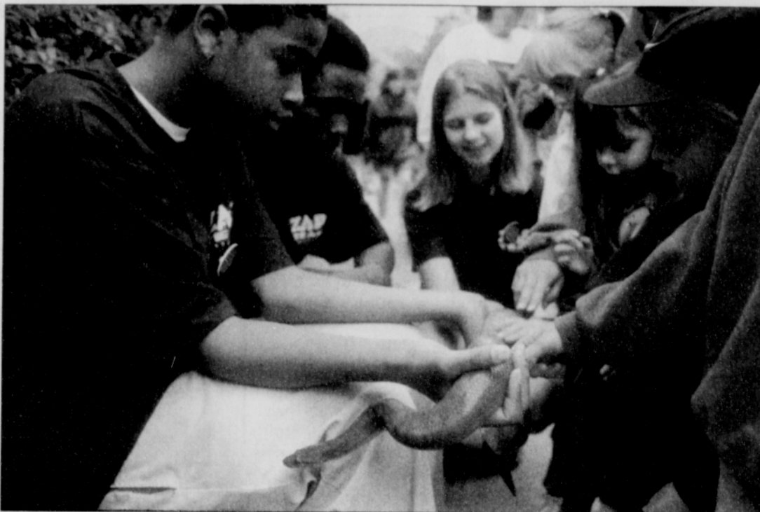
Presenters from Oregon Zoo's Zap program teach young visitors about snakes, up close and personal.

Music, prizes, face painting, snocones and other fun activities are also part of the "Go Wild About Zoos" event co-sponsored by the HomeStreet Bank and "The Buzz" KRSK-FM.