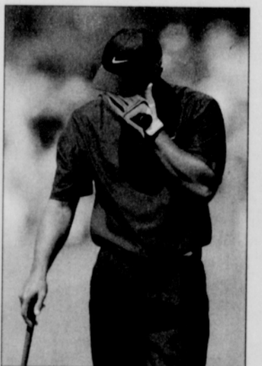
Tiger Woods reacts after his fairway shot on hole eight lands in a rough during the final round of the U.S. Open Sunday at Shinnecock Hills Golf Club in Southampton, N.Y.

Nobody Beats a Thrifty Auto Centers Deal!