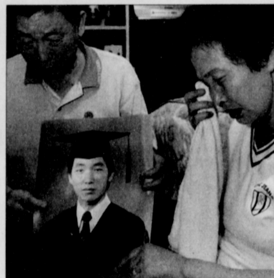
The South Korean parents of a man who was kidnapped and killed in Iraq, hold a photo of their son.

No gun was immediately found, but officers found what appeared to be a bullet hole in the floor.