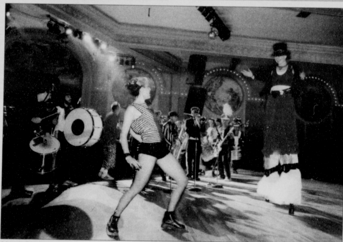
March Fourth and the March Fourth Dancers will be performing at the Waterfront Blues Festival.