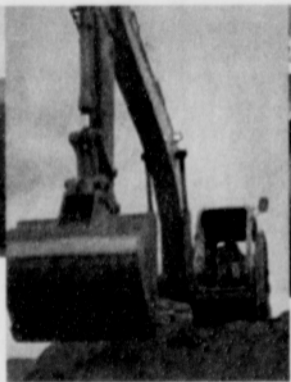
HEAVY DUTY REPAIRER

EUGENE TRAINING CENTER 5001 FRANKLIN BOULEVARD EUGENE, OR 97403 PHONE: 541-741-7292