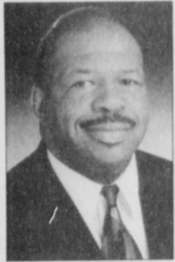
BY U.S. REP. ELIJAH E. CUMMINGS

Opinion articles do not necessarily reflect or represent the views of The Portland Observer